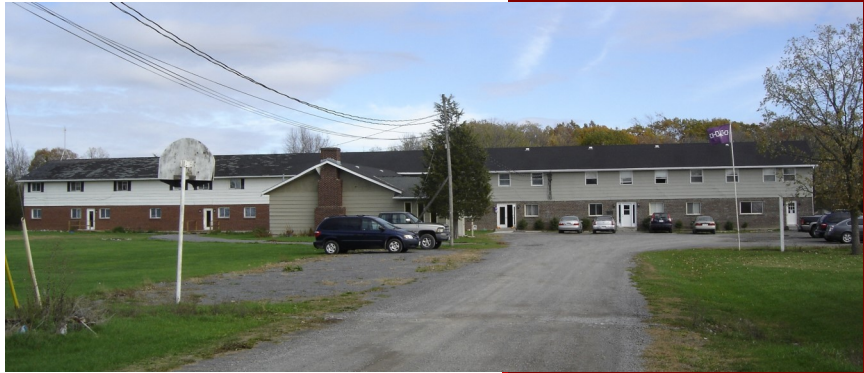
Native New Life Training Centre In Tyendinaga

The early part of 2016 provided several opportunities for various church visits, expounding on the virtues of discipleship training and raising awareness for ABA. The year continued with further exploration of the viability for a local training centre to operate on a regular schedule here in Tyendinaga (Bay of Quite Mohawks).