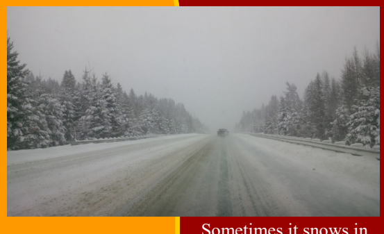
Sometimes it snows in April up north

Early May saw a trip to Montreal for the PAOC General Conference as well as an occasion to address pastors and leaders at a missions emphasis ministerial in Napanee, ON