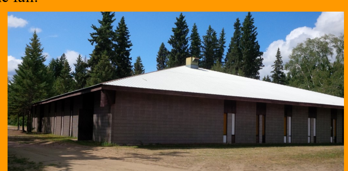
WELCOME TO LIVING WATERS CAMPI

The end of July then provided the chance to attend Aboriginal Ministries Central Camp in Saskatchewan. What an amazing opportunity to make some new connections and explore the very real possibility of a training centre to begin operation in Southend, SK come the fall.