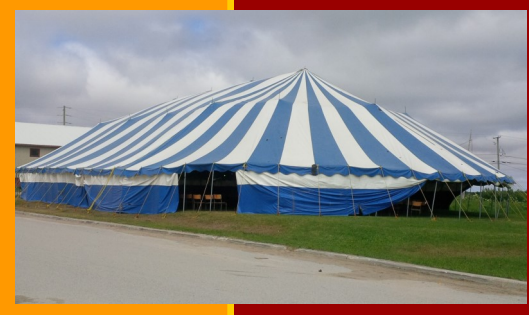
Camp Meeting time in Waskaganish, QC!

emphasis, as well as, an invitation to be one of the camp meeting speakers in Waskagansh (northern Quebec). Excellent opportunities presented themselves while up on the east coast of James Bay and we look forward to return trips in the near future.