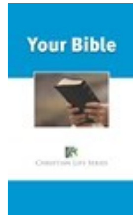
Your Bible is Course 2 in Unit 1.

The Christian Life series comprises of 18 courses, divided into three units of six courses each