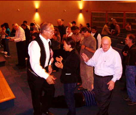
Aboriginal Leadership Summit

The closing of September will see a trip to Chilliwack, BC for the annual Aboriginal Leadership Summit. This is always a special time in re-connecting with native pastors and leaders from across BC.