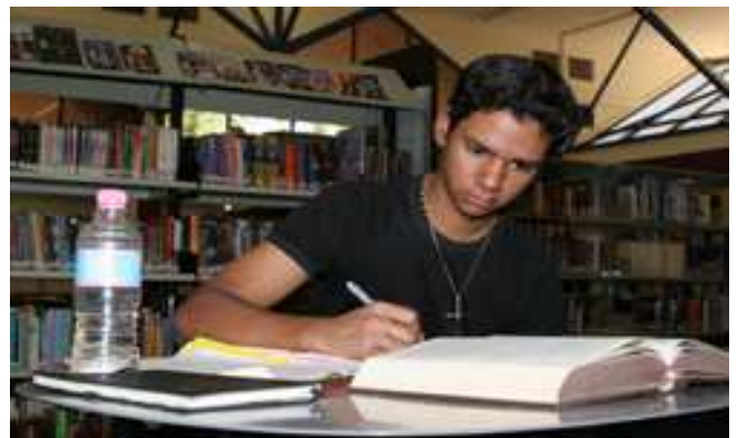
A First Nations student involved in his studies

Here at Aboriginal Bible Academy we are purposed for this very endeavour. Through various distance education mediums, the availability of adult continuing education courses in essential biblical studies are made accessible to anyone interested. And by providing assistance through in-service training of church members, while also creating an educational experience that will enhance the abilities and encourage indigenous leadership in our communities and our church congregations, we at ABA certainly pray that the efforts put forth will indeed, "produce a harvest of righteousness and peace for those who have been trained by it" .