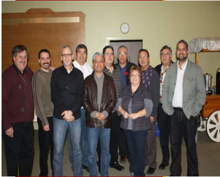
Members of the Mission Canada Aboriginal Guiding Group

One of the wonderful honours afforded to me as the director of ABA has been the privilege of serving on the PAOC's Mission Canada Aboriginal Guiding Group. This group is comprised of individuals from all across Canada