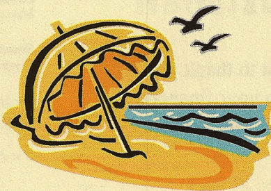
His Word brings times of refreshing.

Many years ago an elderly gentleman told me to get all the education that I could because it was easy to carry around. He was right. It is light.