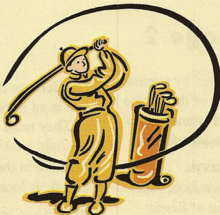
Stay on course with God's direction

If you feel a nudging towards a more serious study of the Word, then don't hesitate to call or if you simply need some more information on our courses, we have a friendly staff at Native New Life Centre waiting to respond to your inquiries.