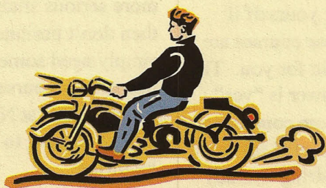
Going forward in victory with Christ!

The Bible teaches us that the sins of the father are visited down to the third and fourth generations. This was demon-