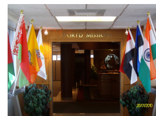
Entrance to World Mis-