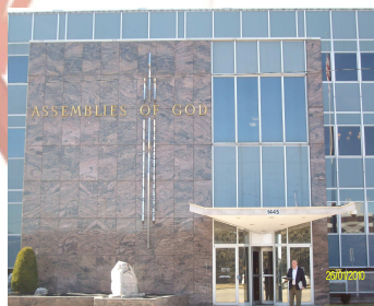
Cal at the entrance to the Assemblies of God Headquar-

We sat in on a chapel session and then were privileged to be taken on a personal tour of the beautiful facility.